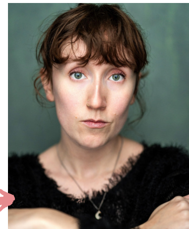
This is Rosa Hesmondhalgh, who plays Lizzy Bennet.