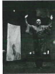
Kiss of the Spider Woman's oppressive, intimate set

Reader Reviews: View and add to our user reviews